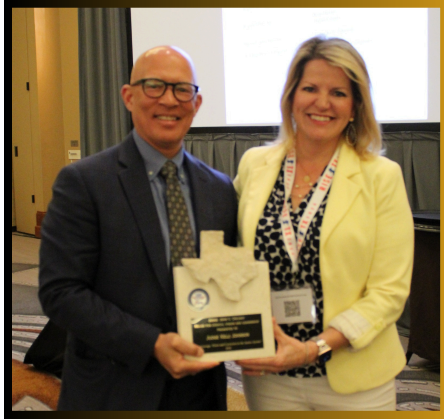
Judge Kelli Johnson 2024 Recipient

“For Courage, Vision and Conviction in the Justice System”