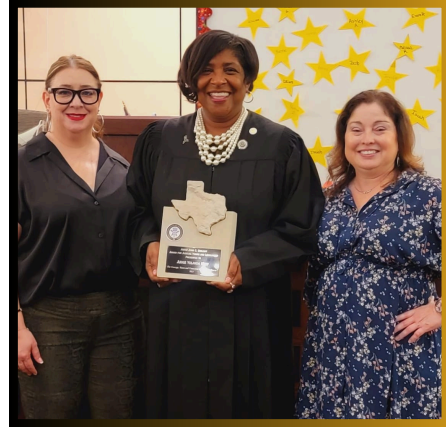
Judge Yolanda Huff 2023 Recipient

Judge Creuzot is a pioneer of drug courts in Texas playing a significant role in changing the courts of criminal justice in Texas. Judge Creuzot recognized the need to steer the Texas criminal justice system in a different direction by giving repeat drug offenders an opportunity to change in the face of great opposition. Ignoring criticism and a new nickname, “let'em go Creuzot,” Judge Creuzot demonstrated courage, vision, and conviction to the belief that drug courts were an evidence-based practice worthy of establishing in Texas.